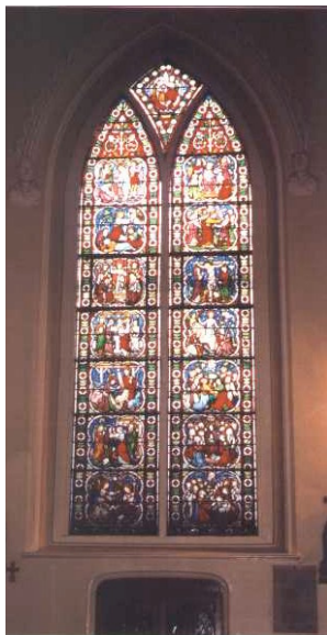
Stained Glass Window depicting the Meditations of the Rosary - fifteen different pictures which trace the story of Jesus on earth from birth to death and coronation in heaven