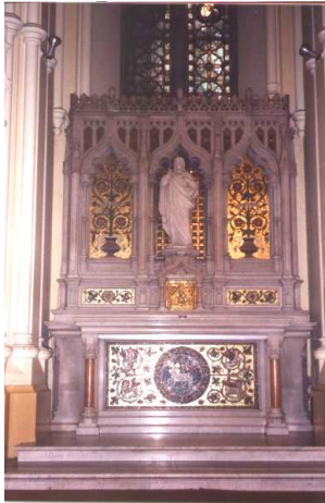
Sacred Heart Altar in fine mosaic of gold and rich colours depicting the Lamb of God surrounded by the four Evangelists