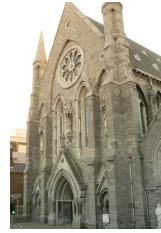
St. Mary of the Angels

The priests of the parish and the Parish Pastoral Council wish you and your family peace.